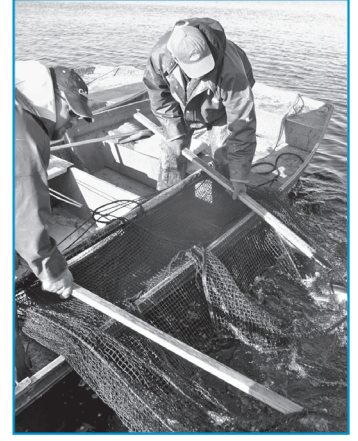
Hatchery workers haul a trap net filled with ripe walleyes.

We will be open seven days a week, 8 a.m. to 3:30 p.m., starting in April. Our lobby features a video showing the entire walleye rearing process, along with displays, and fish and wildlife mounts. Visitors get close to fish and fish culturing technology at our hatchery! A trip to our Constantia facility makes for an enjoyable family outing.