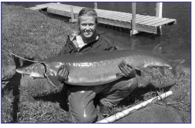
A Cornell researcher holds a mature sturgeon from Oneida Lake's increasingly healthy restocked population.

Oneida Lake Bulletin - Your Environmental Voice for Over Sixty Years