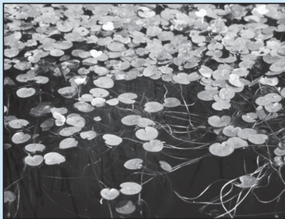
The invasive European frogbit - another potential Oneida Lake problem.